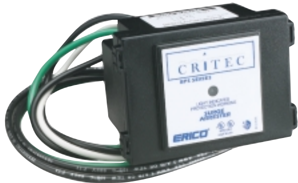
Simple SPD end-of-life indication.

Due to the possible removal of protection, most SPD products will have some form of visual indication to show that protection is no longer being provided. Most often this takes the form of an indicator light being extinguished. As this SPD failure will leave the downstream equipment unprotected, better products will have some method of "predictive indication" before all protection is removed from circuit, such as a "percentage remaining" indication system.