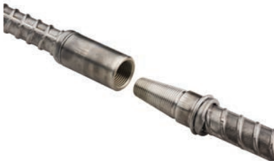
MT12 MALE TAPER STUD