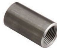
FT12 FEMALE STANDARD COUPLER