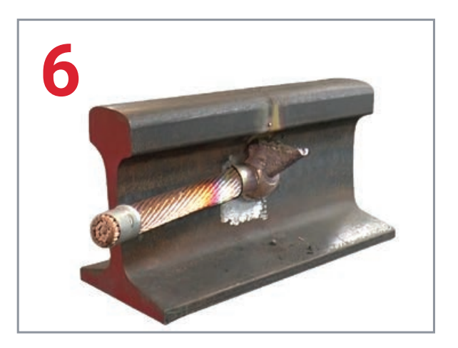
After reaction, open the mold and remove the expended steel cup – no special disposal required.