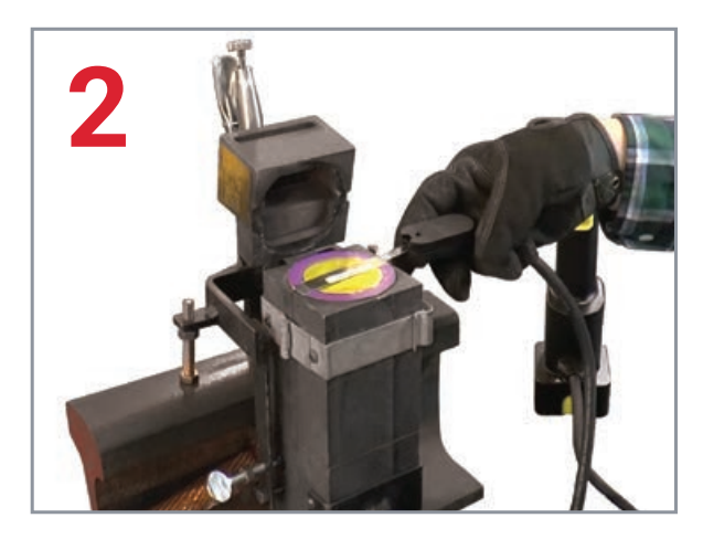
Attach control unit termination clip to ignition strip.