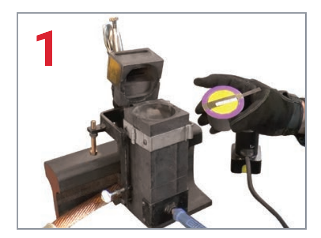
Insert Cadweld Plus cup into mold.

Proper rail surface preparation is paramount for any rail bond connection. Lightly grinding the rail surface, removing surface oxidation on the conductors, and drying and heating the rail and molds are highlighted in the instruction print. Once the preparation is completed, the four steps below complete the Cadweld Plus process.