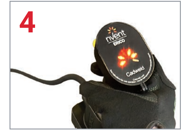
Release the control unit trigger guard, press and hold the switch and wait for the ignition.