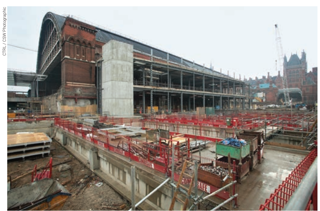
Work on the Thameslink Box outside of St. Pancras Station.