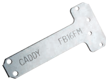
Material: Steel Finish: Pregalvanized