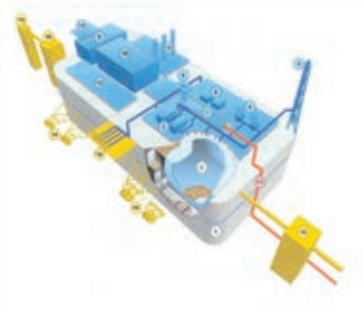
Massive 160m x 39m x 33m LNG Tanks aboard the GBS

source in direct contact with a sand or concrete foundation and walls within the GBS, STS offered the most efficient heat transfer. STS was proven, via finite element analysis, to be the only system capable of providing the uniform heat required across all concrete walls to prevent stresses caused by differentials in temperature. Also by using the STS system, wall temperatures were maintained within 2-3°C to prevent boil-off of the refrigerated LNG. nVent was able to provide a 100% redundant system that would not allow any failed circuit to cause any two adjacent heating lines to fail, meeting the project goal of maximum reduction of risk to degradation of the maintain temperature.