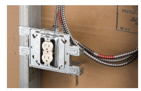
If applicable, select any wiring device from any manufacturer.

nVent CADDY ALL-IN-ONE, STS2346, C23, RBS16, RBS24, TSGB1624, TSRBS1625, TSGLDR, FMBS1624