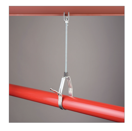
Material: Steel Finish: Electrogalvanized